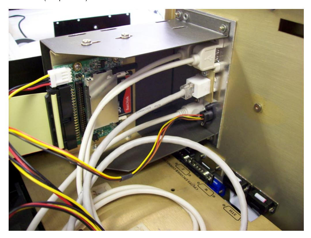
Picture 2: This is how the I/O panel and floppy drive bay w/ SSHD should be mounted.

9. Mount USB cables, Ethernet, KB and mouse connectors to I/O panel. Take the floppy drive bay and flip it 180 degrees from its normal orientation, so the bottom is against the side wall of the M15. Mount the SSHD into the floppy drive bay. Place the I/O panel where the plastic went for the floppy drive door, then place the floppy drive bay against the I/O panel and secure from the back with 6-32 screws. (see picture 2)